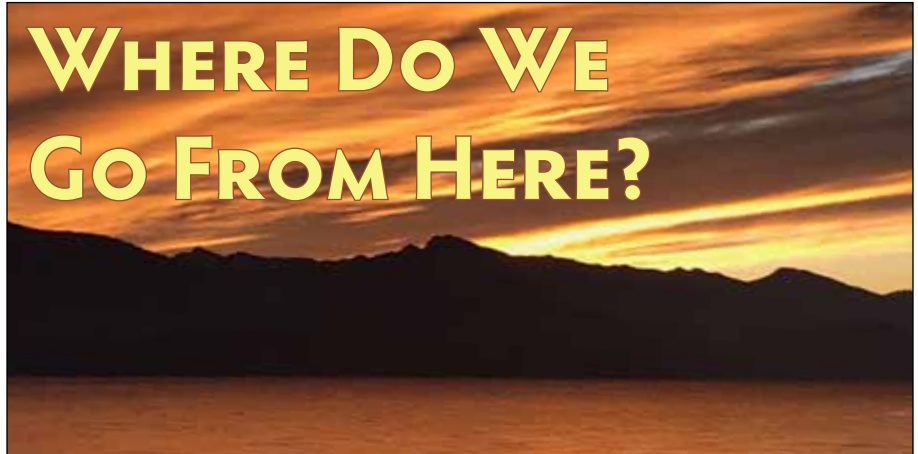
Dawn highlights the silhouette of the Scotchman Peaks