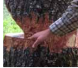
Simple math (and a Sharpie) make a cut plan easier to understand

This is a simplified version of OHLEC, but the real training — which moves out of the classroom and into the field more quickly than the old training — is not much more complicated that