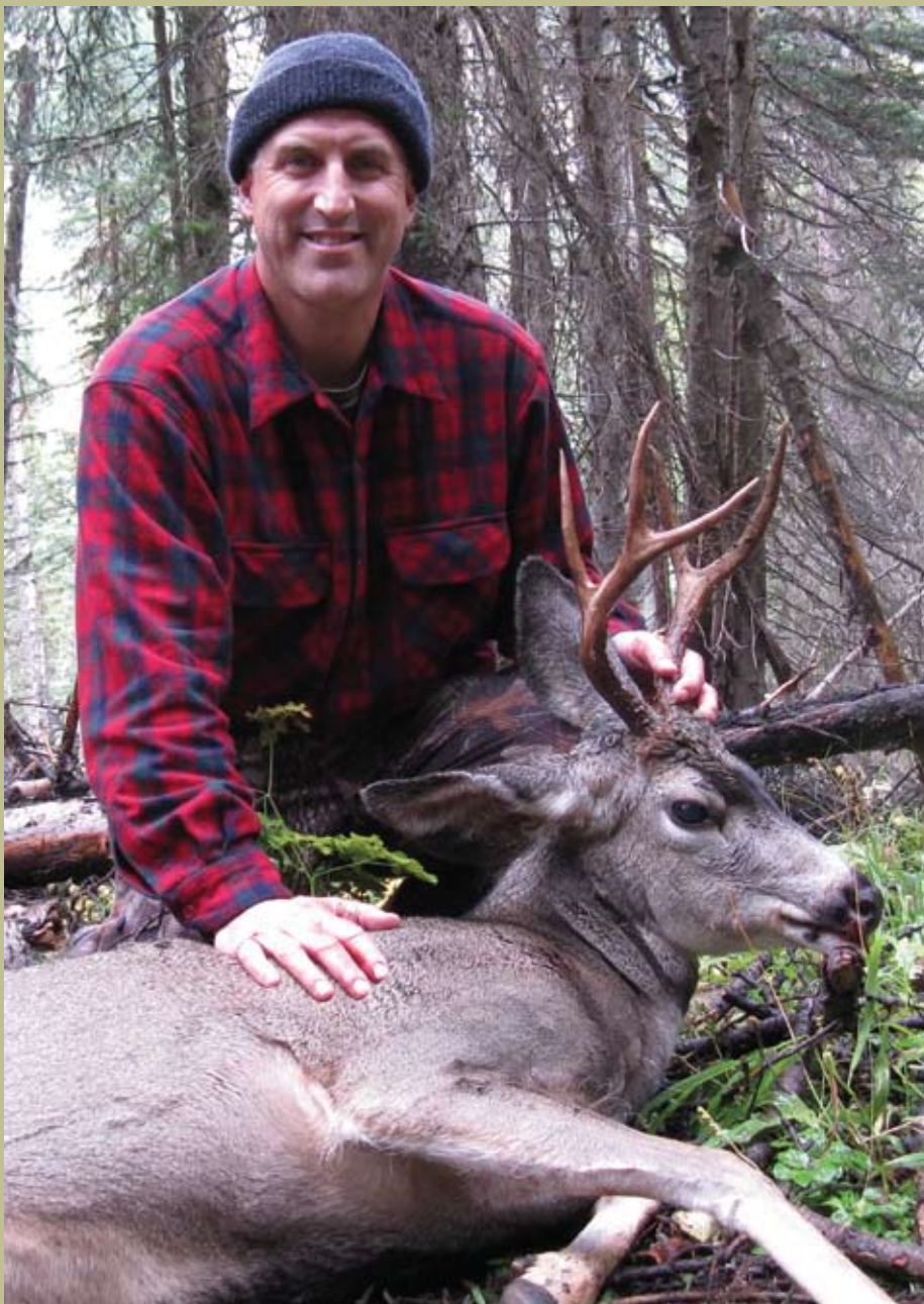
Any backcountry game taken in fair chase is a trophy.

of teachers, coaches and others in his formative years.