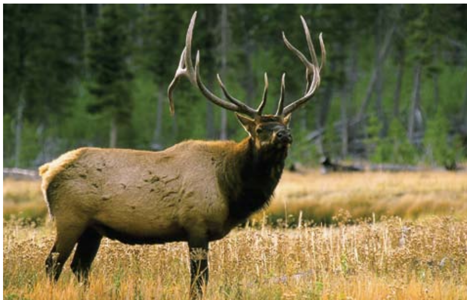
Bull elk in Wyoming embody the spirit of the backcountry.

year-old filly. Now the mare is old and still sweet. Up here, in this high place of wapiti and grizzly, she could walk all the way back down the trail to the old pickup, or she could point her blue roan nose north and be in Montana in a week or so without crossing one fence. That is the definition of freedom, but she will stay because her friends are here and so is the grass. A young mule gets the same treatment. Mules love mares. Two picketed mares will hold an army of mules.