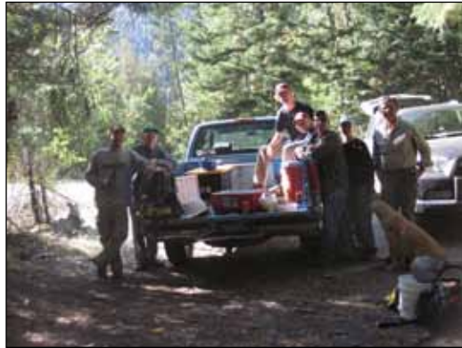
Morris Creek trail crew, September 26, 2015