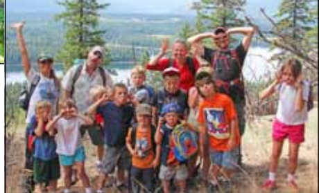
The main push on trails this year will be the realignment of the lower mile of Scotchman Peak Trail #65. "This is

going to be a really cool project," said Compton. "The Friends Continued on page 11