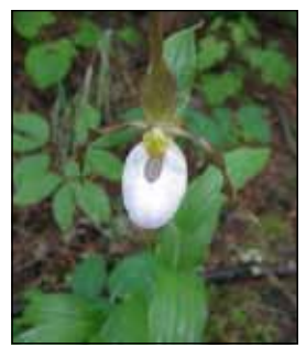
Mountain Lady Slipper. CArol Wilbrun

one or several of the low-growing Fairyslippers, light pink- or purple-flowered orchids of moist, shady areas. Fairyslippers have a single elliptic leaf at the base of the stem, and when they are not blooming they are hard to spot. These intriguing plants are very sensitive to trampling, and picking the flower usually kills the plant, so admire them but tread carefully. In some places,