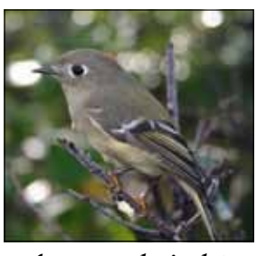
Ruby-crowned Kinglet.

more than a month ago in the lowlands, but at the higher elevations they are just now emerging from where they wintered under the ice. Sometimes even while ice remains at the water's edge, these relatively As the days grow longer and the sun common frogs of the mountains traces a higher arc across the sky, its gather to breed. The males give heating effect is apparent in the moderattheir quiet calls from ponds with ing weather. Morel mushrooms are poking both aquatic vegetation and open their fruiting bodies up through the