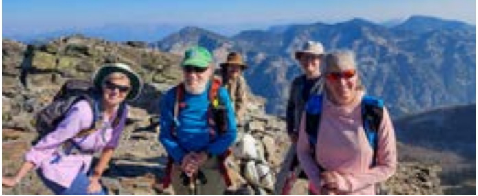
Hikers atop Scotchman Peak during the annual fall hike

FSPW hosted the State of the Scotchmans at Blue C Ranch with Boulder Creek Bluegrass Band. We had the opportunity to present special volunteer awards to our outstanding volunteers, and update our supporters on programming and progress on designation.