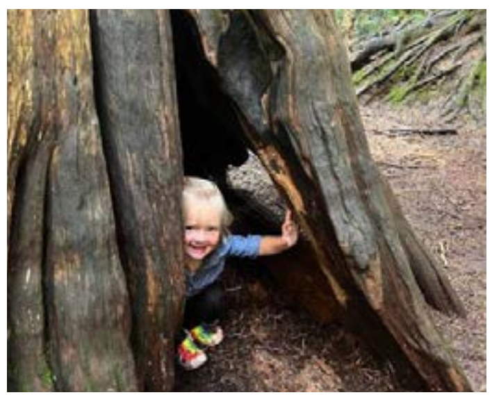
Playing peek-a-boo during a kids hike in the Ross Creek Cedars

Our goal is to bring people together through a shared love for our wild backyard - the Scotchman Peaks. We want everyone to have the chance to explore the wonders of the Scotchmans.