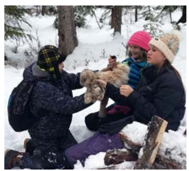
Libby students get some hands-on learning with furs of local animal species