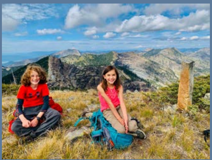
Two of Rebecca's children enjoying one of their many excursions into the Scotchman Peaks

"The alluring landscape of the Scotchman Peaks has provided countless adventures for my family to enjoy. From winding creek beds vibrant with life to the mountain tops where wild goats tread a path of their own, there is an endless supply of new discoveries to be made. We wrestle the alder and tackle the steep terrain, knowing it is all worth the effort. Whether it be a snowshoe trip up