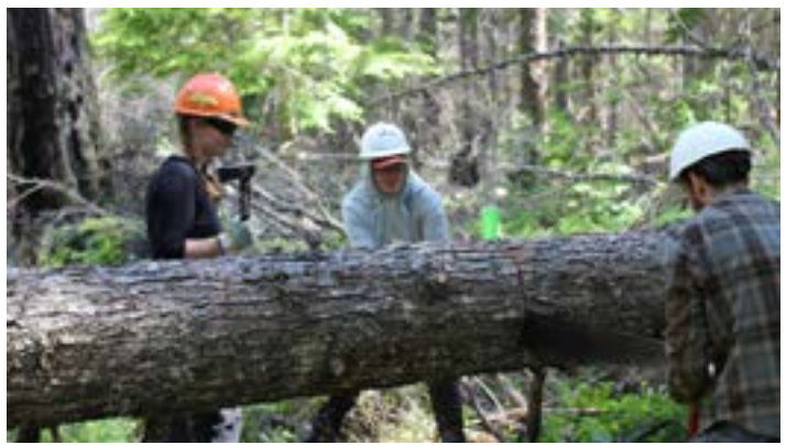
In 2022, FSPW volunteers and staff cleared over 64 miles of trail using traditional tools like cross-cut saws